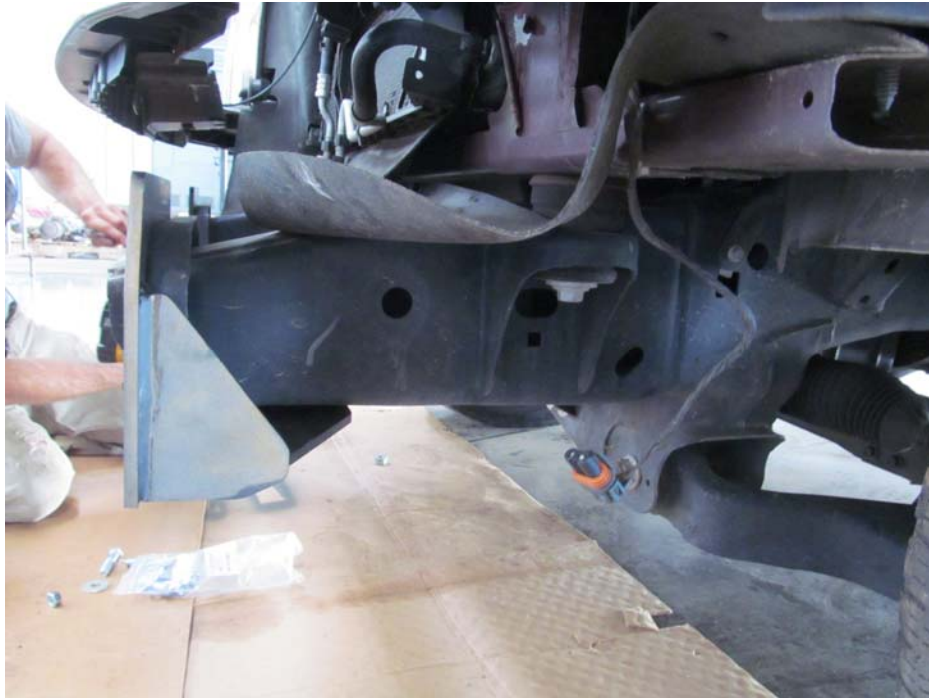
Figure 10: Driver side view of mounts

2009-20XX FORD F150 OR 2010-20XX FORD RAPTOR