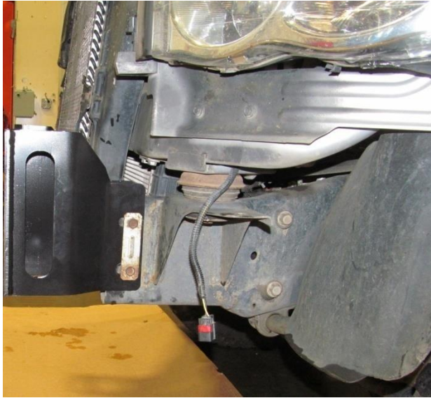
FIGURE 5: SIDE VIEW (DRIVER SIDE)