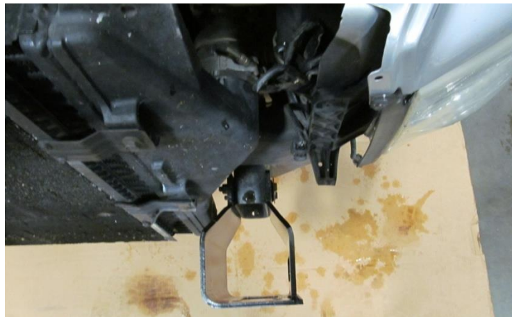
FIGURE 6: TOP VIEW (DRIVER SIDE)