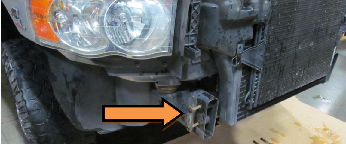
FIGURE 3: POSITION OF BOLT STRIP ON PASSENGER SIDE