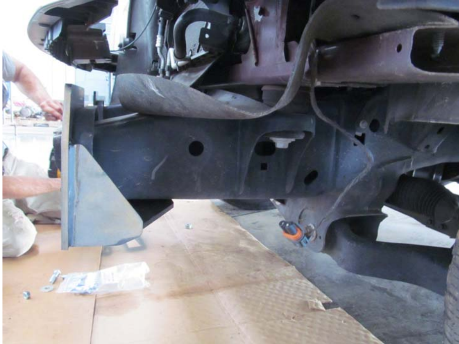
Figure 10: Driver side view of mounts