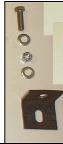
Angle bracket & bolts used on 1500 series only