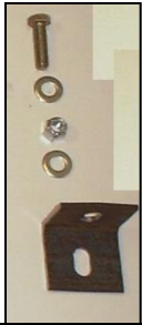
Angle bracket & bolts used on 1500 series only