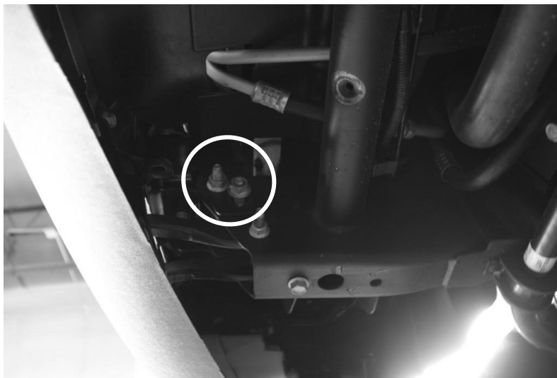
Figure 3 - STUD PLATE NUT LOCATION