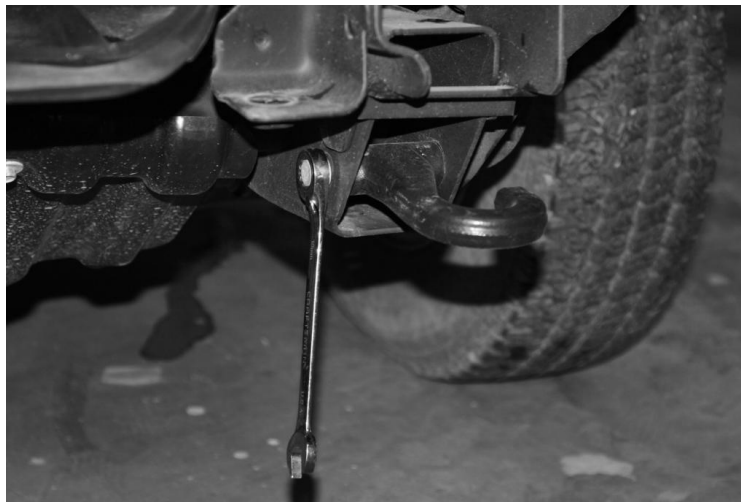
Figure 4 - TOW HOOK