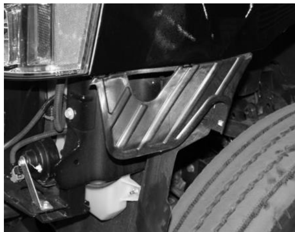
Figure 5 - SUPPORT STRUCTURE LOCATION