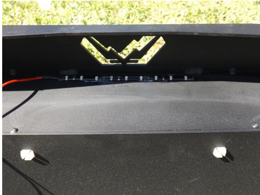
Figure 5 – LED Strip Location